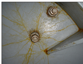
Figure 6: Bolts on outside of drum.

Inevitably there are other securing methods available and if any delegate is aware of such a method then please share it with me to incorporate in later publications. One factor which should be taken into consideration is that, whatever securing method is used, it should be able to allow the bitter end of the tow rope to fly free if the situation arises where the winch brake fails and all the line is allowed to run off the drum, with the minimum amount of damage to the winch itself. You certainly don't want a fixing method that would have the rope still hard fixed in such a way