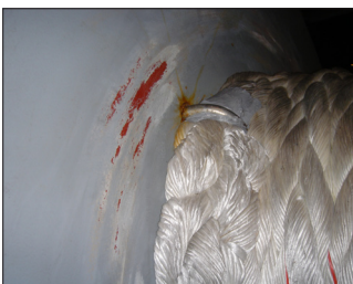
Figure 5: U-bolt fixing tow rope to cheek of drum.