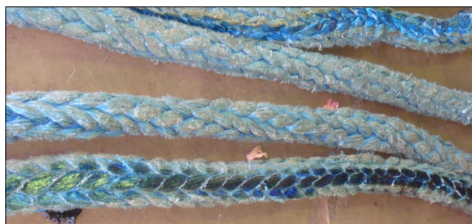
Figures 1 and 2: Section of 64mm AmSteel Blue damaged because it was not secured to the winch drum or bedded in.